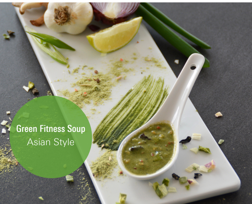
Green Fitness Soup Asian Style