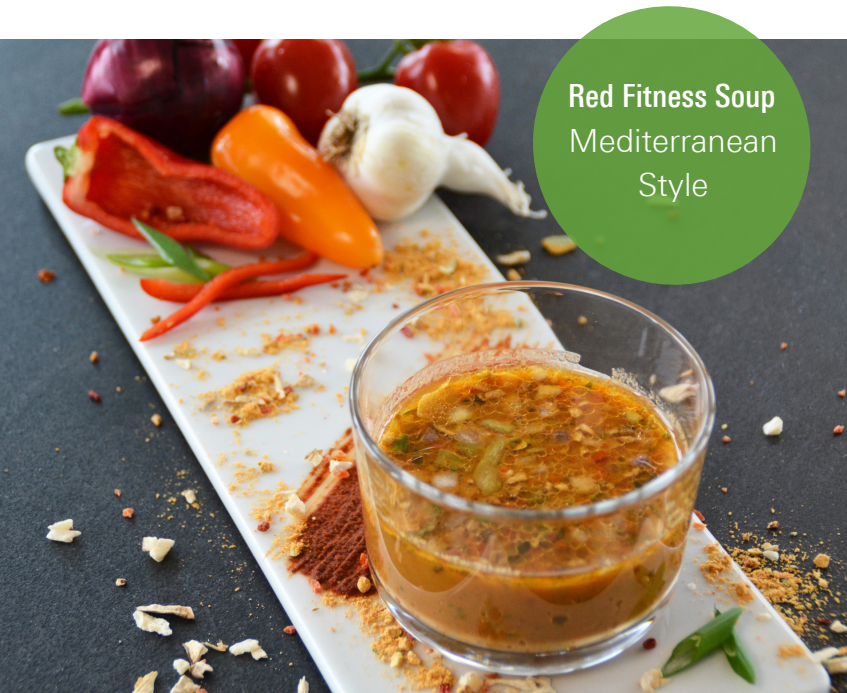
Red Fitness Soup Mediterranean Style